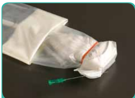
NEW! Smaller Gauge Guides